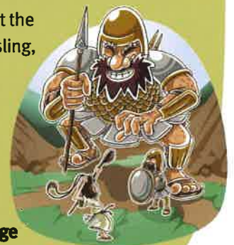
Bible story based on 1 Samuel 17

This was a day no-one would forget, when the courage of a shepherd boy saved a nation.